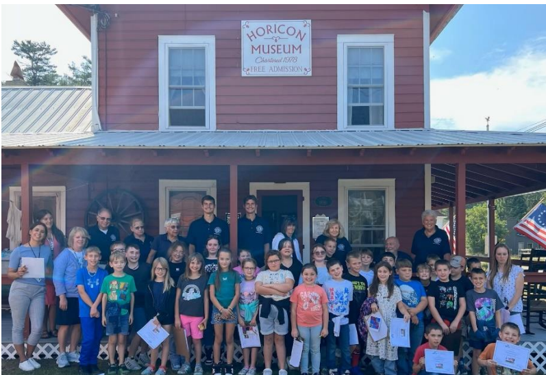
Fourth Grade Educational Tour