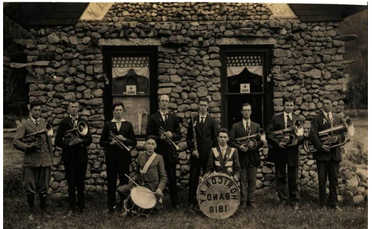
Bustling Days of Early Brant Lake