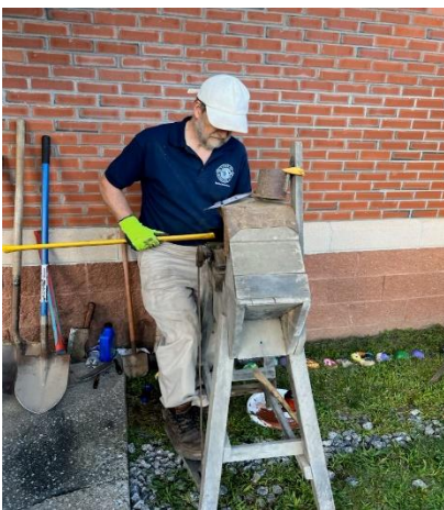
Demonstration at Food Truck Friday