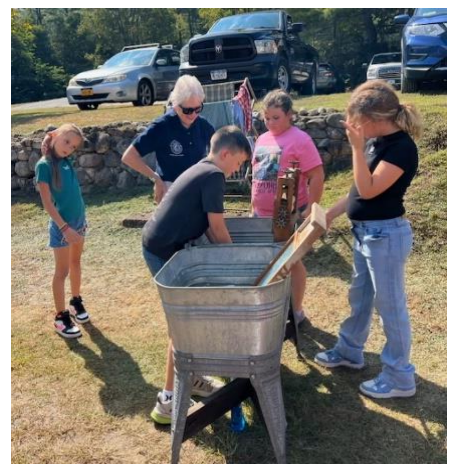
The Ole' Fashioned Way