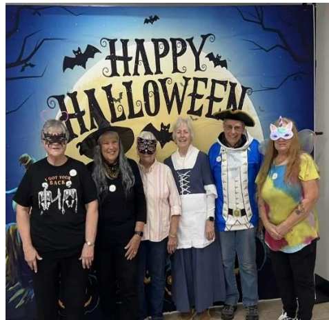
Happy Halloween 2024