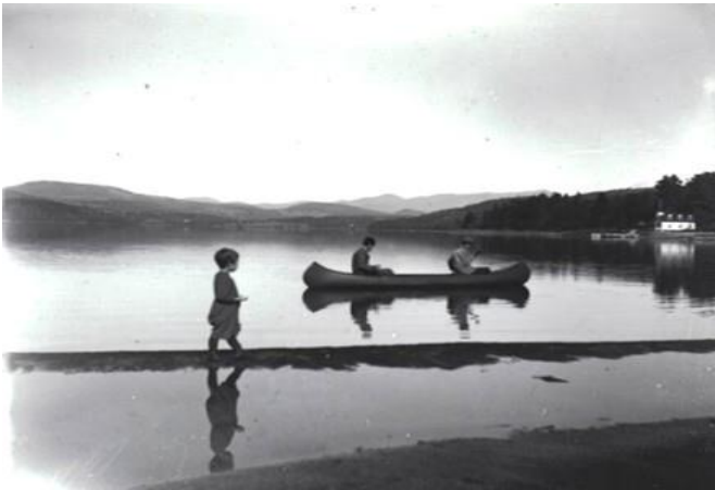
Early Days in the Adirondacks