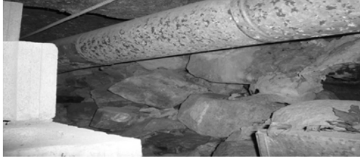
The stone foundation is failing.