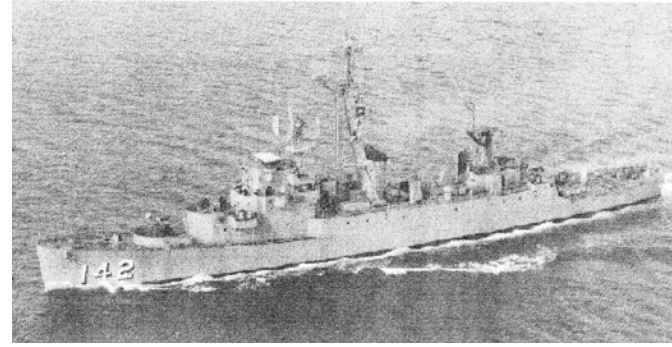
DE 142 Fessenden